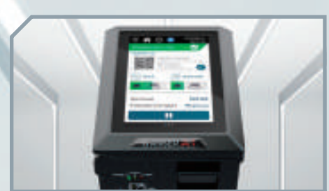
Low Cost of Ownership

zero operating maintenance requirement to reduce unnecessary expenses