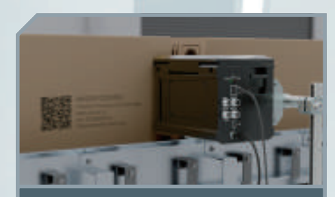
Eco-Friendly Direct Coding

Reduce label usage and preprinted box wastes to support environmental sustainability